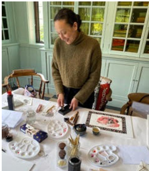
SAM Asian Inks with bamboo and brushes

EVERY SATURDAY & SUNDAY BETWEEN 6 TH & 22 ND JUNE