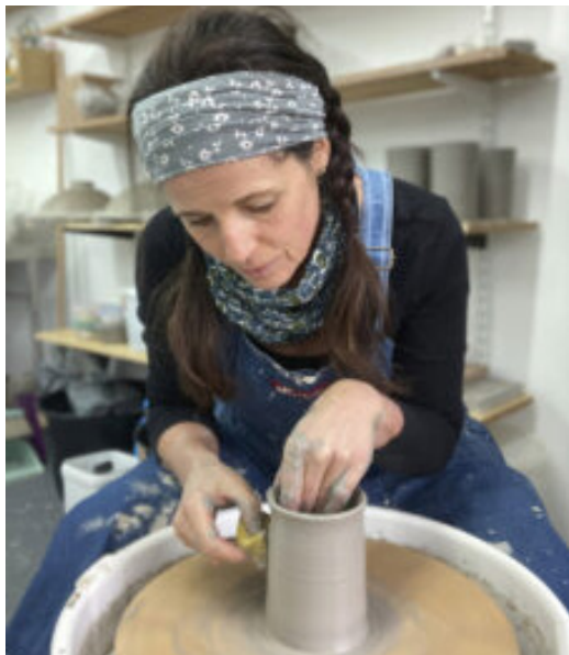
JUDE Pottery wheel tips