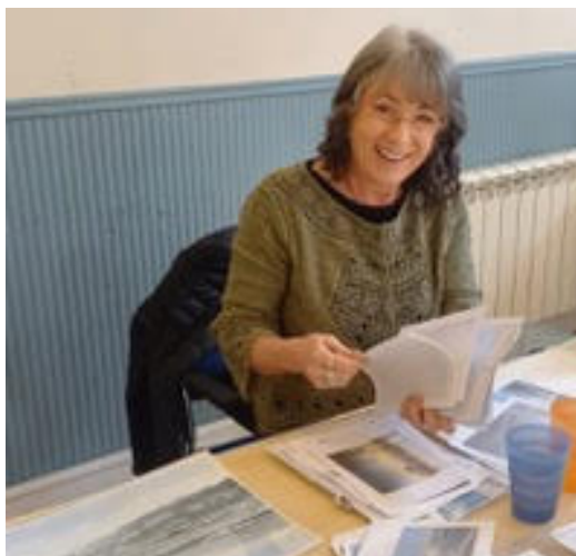
KERRY Watercolour techniques