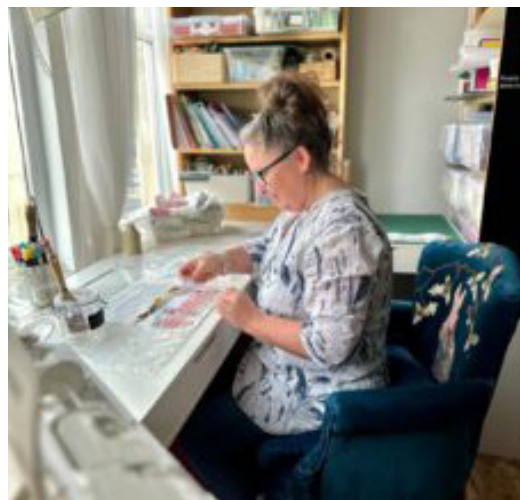
VIV Free flow stitching